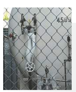
Many inspection sites are challenging for certain autofocus systems.

LaserSharp® Auto Focus, uses a built-in laser distance meter that calculates the distance to your designated target with pinpoint accuracy.