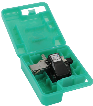
Shown in CC-28 Carrying Case