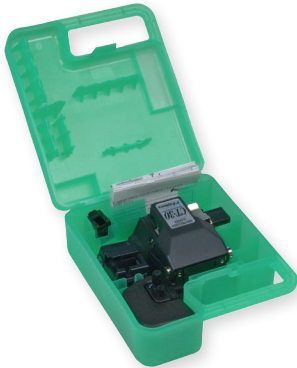
Shown in CC-21 Carrying Case

The CT-30 Cleaver is packaged with three scrap collection options that allow the user to tailor it to their cleaving preferences. The CT30 is delivered with the SC-01 Side Cover installed for users that prefer not to use an automated scrap collection system. For those that prefer an automated scrap collection system, the FC-02 Fiber Collector and two scrap box options are included. The FDB-02 Scrap Box is a smaller bin for users seeking a compact profile. The FDB-03 Scrap Box is a larger bin with sweeping brush and static resistant surfaces for those users seeking to maximize scrap capacity. All scrap options are easily configured by the user.