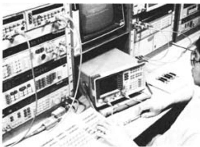
HP 8590 series RF spectrum analyzers have built-in tracking generator option