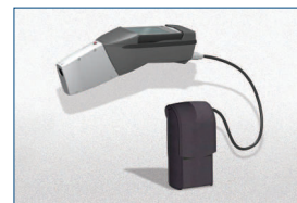
Removable handle with belt-mount battery pack for testing in tight places.