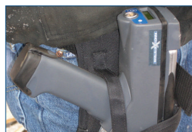
Custom holster lets you take Alpha Series anywhere.

Precision for several common alloys, for 20 second test times. Note test times are 2-3 seconds for rapid sorting applications.