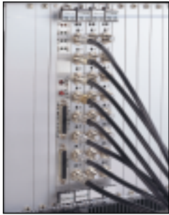
◀ Close up view of the rear of HCU1500 showing 3 RPM1000 modules installed.