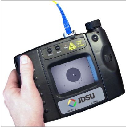
HD2-P4-V Display with Integrated PCM and VFL