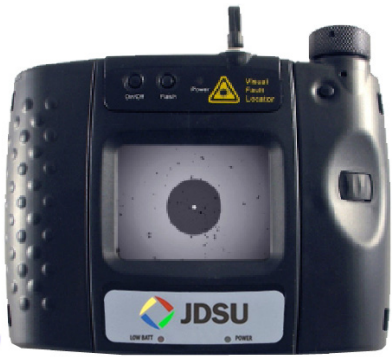
HD2-P4-V Handheld Display with 3.5-in LCD