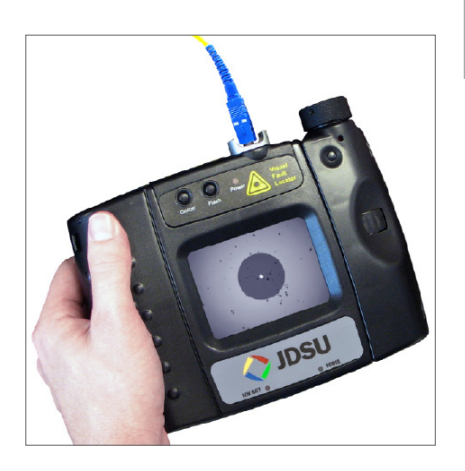
HD2-P4-V Display with Integrated PCM and VFL