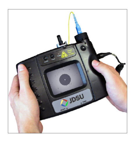
HD2-P4-V Display with Integrated Patch Cord Microscope (PCM) and Visual Fault Locator (VFL)