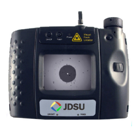
HD2-P4-V Handheld Display with 3.5-in LCD