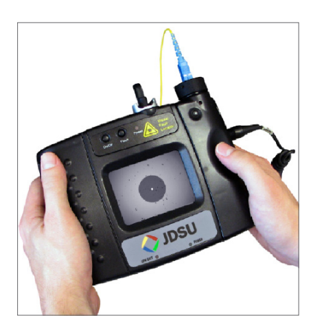
HD2-P4-V Display with Integrated Patch Cord Microscope (PCM) and Visual Fault Locator (VFL)