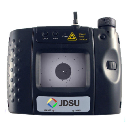
HD2-P4-V Handheld Display with 3.5-in LCD

Rugged, Versatile Handheld Display with 3.5-inch TFT LCD