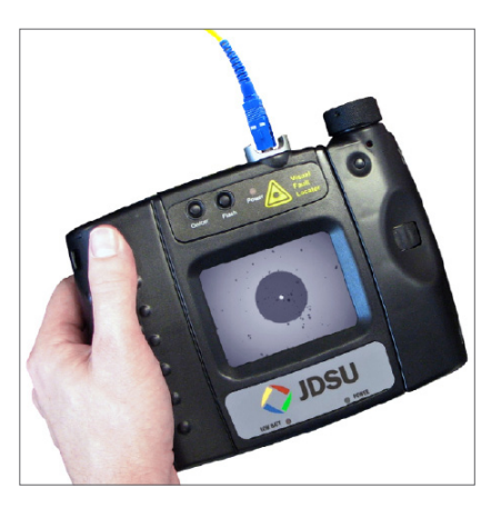
HD2-P4-V Display with Integrated PCM and VFL