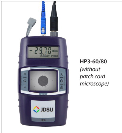
HP3-60/80 (without patch cord microscope)