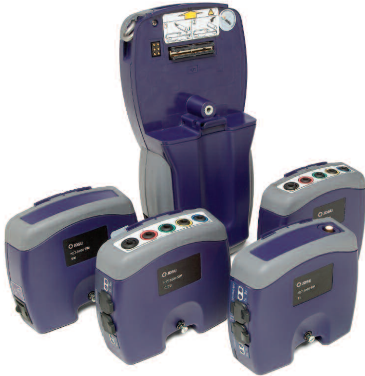
Figure 2. The architecture of the HST-3000 enables fast, easy field-swapping of a wide variety of test modules.

To accommodate the future and changing needs of wireless field technicians, the HST-3000 is an easily upgradeable platform that will allow for the support of new technologies and advanced options.