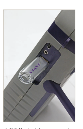
USB flash drive supports transferring test results