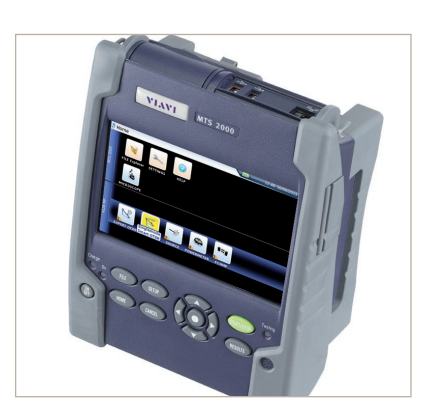
For more fiber testing and certification capabilities, combine the Certifier 40G with one of the market-leading Viavi fiber testers, such as the T-BERD/MTS-2000