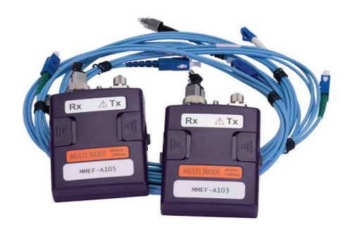
Multimode (encircled flux) modules

1. Append model number with -NA, -UK, -EU, -AU for regional power cords.