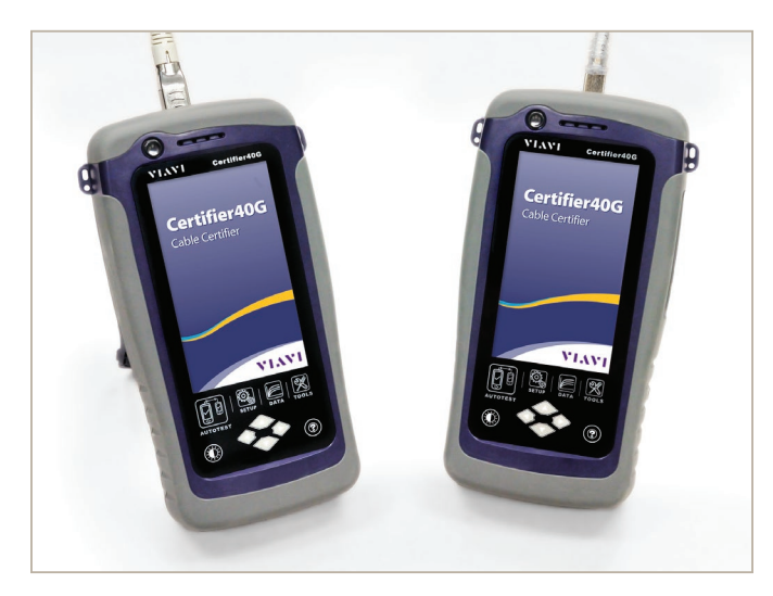
Two complete units minimize time initiating, naming, and saving results