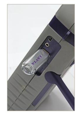
USB flash drive supports transferring test results