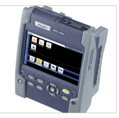
For more fiber testing and certification capabilities, combine the Certifier40G with one of the market-leading Viavi fiber testers, such as the T-BERD/MTS-2000