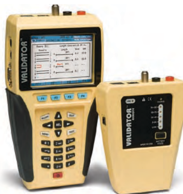
Validator and smart remote