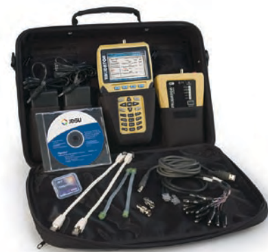
Validator Ethernet Speed Certifier Kit (NT950)