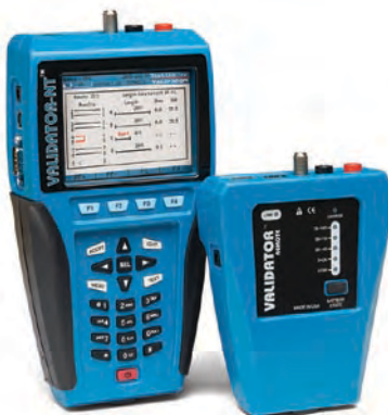
Validator-NT and smart remote