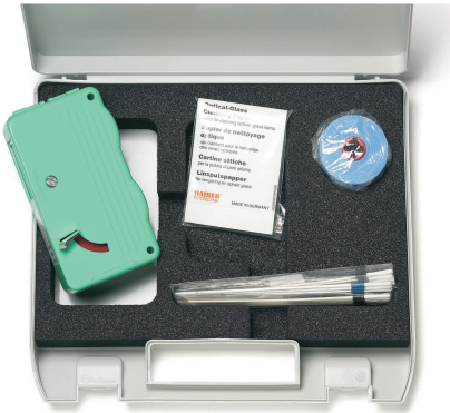
OCK-10 Optical Connector Cleaning Kit (accessory)