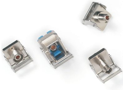
Optical adapters (BN 2150)