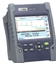
One-Slot Handheld Modular Platform Fiber Networks Testing