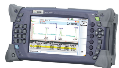
Two-Slot Handheld Modular Platform Fiber/Copper & Multiple Services Testing