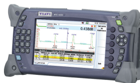
T-BERD/MTS-4000 two-slot handheld modular platform for testing fiber, copper, and multiple services