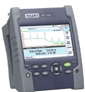
T-BERD/MTS-2000 one-slot handheld modular platform for testing fiber networks