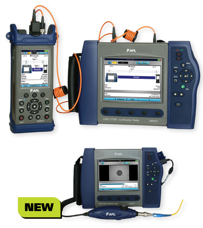
C860 with DFS1 Digital FiberScope