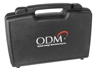
VIS 400 unit comes with 4 standard inspection tips and cleaning kit in a hard carry case.