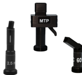
Interchangeable adapter tips provide inspection of many different connector types.