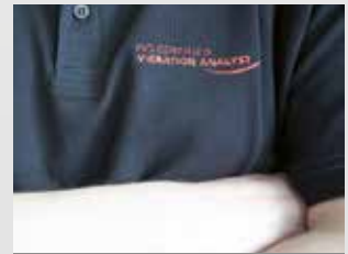
Service & Support

Laser measurement systems and services for optimum alignment of machines and systems.