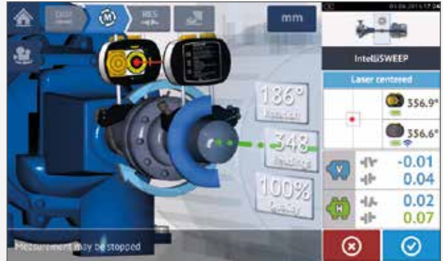
As shafts are rotated, measurement quality is clearly displayed – a green or blue sector indicates good measurement data.

As shaft rotates, hundreds of real measurement points are taken automatically. The results are far more accurate than those based on 3 measurement positions.