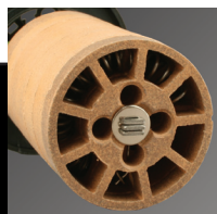
DuraTherm™ Heating Element