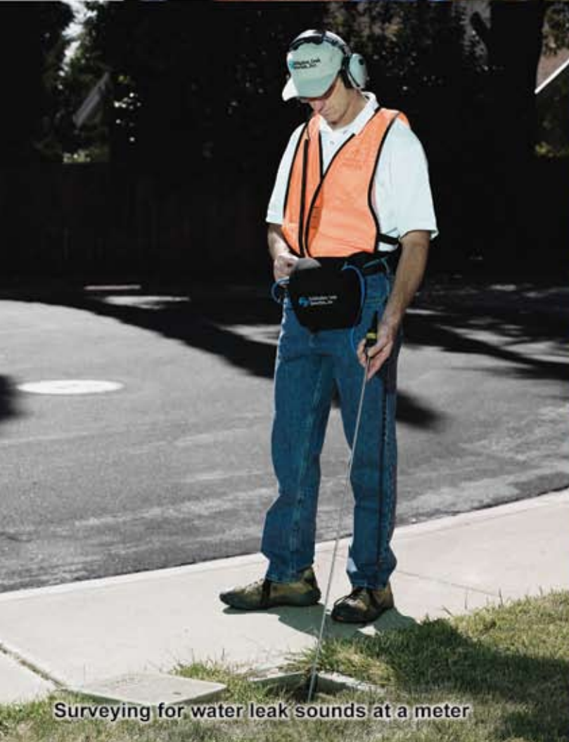
Surveying for water leak sounds at a meter