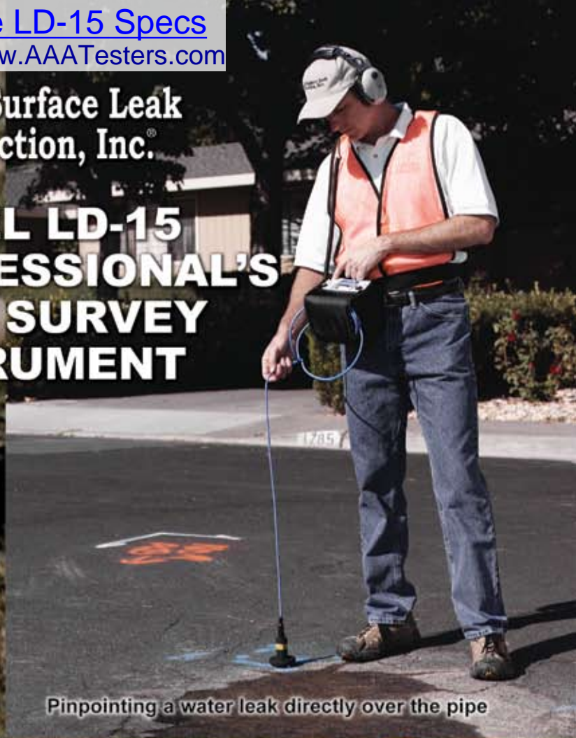
Pinpointing a water leak directly over the pipe