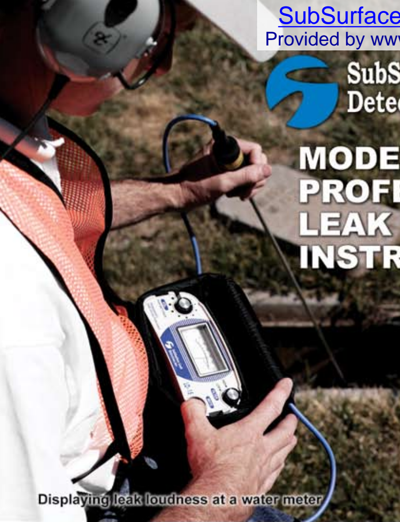
Displaying leak loudness at a water meter