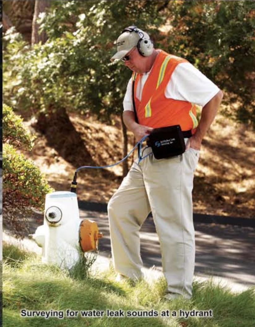
Surveying for water leak sounds at a hydrant