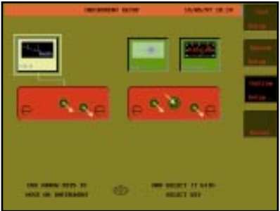
Top Screen With simple pull-down measurement parameters and system option menus, MTS is easy to operate.

Bottom Screen The Instrument Setup screen permits rapid selection and setup of optical test functions. MTS immediately recognizes installed modules and displays a clear, graphical representation of available and selected functions.