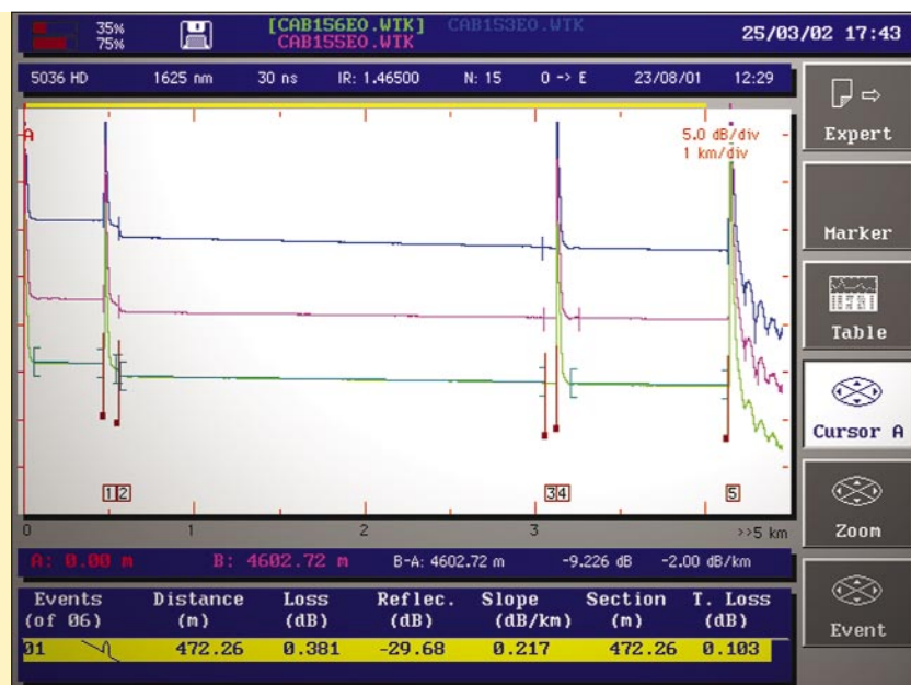
Multiple wavelength display with a single press of a button

The MTS ® OTDR module is the fastest and most accurate OTDR to-date. It offers a dynamic range of up to 44 dB at 1550 nm and boasts a 0.1 second sweep time. As part of the MTS ® , the OTDR module has a test capability of more than 200 km and can measure up to 128,000 separate datapoints with 4 cm sampling resolution. The product's short deadzone enables the user to differentiate events down to 1 meter.