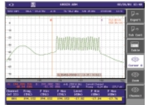
Results screen with statistics on wavelength values

The MTSe automatically provides all the necessary parameters to maintain a DWDM network. By pressing a single key, the MTSe performs an acquisition followed immediately by an analysis of the existing channels. This enables the user to rapidly detect if a channel is lower in power or missing, or if the entire network has been degraded.