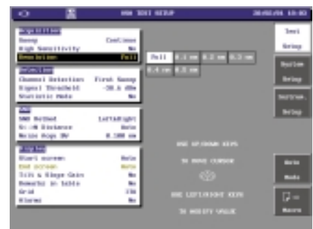
Comprehensive set-up screen

The 5071 WDM module has a comprehensive file management system, which allows successive files to be named and stored automatically, semi-automatically or manually.