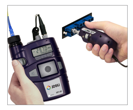
FBP Probe with HP3-60-P4 Fiber Inspection and Test System