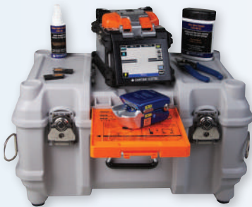
Quantum Transit Case as Work Surface