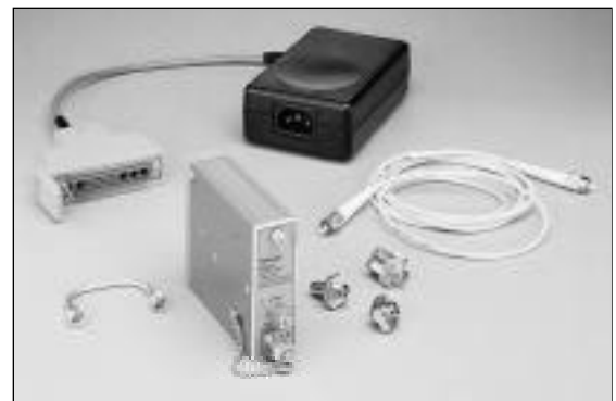
ORR24 with standard accessories and optional power supply.

Note: Allowable deviation from the nominal attenuation in the table is very tightly specified in the SDH/SONET recommendations. The actual allowable deviation values depend on f/f_r and the bit rate. These values run as low as \pm 0.5 dB.