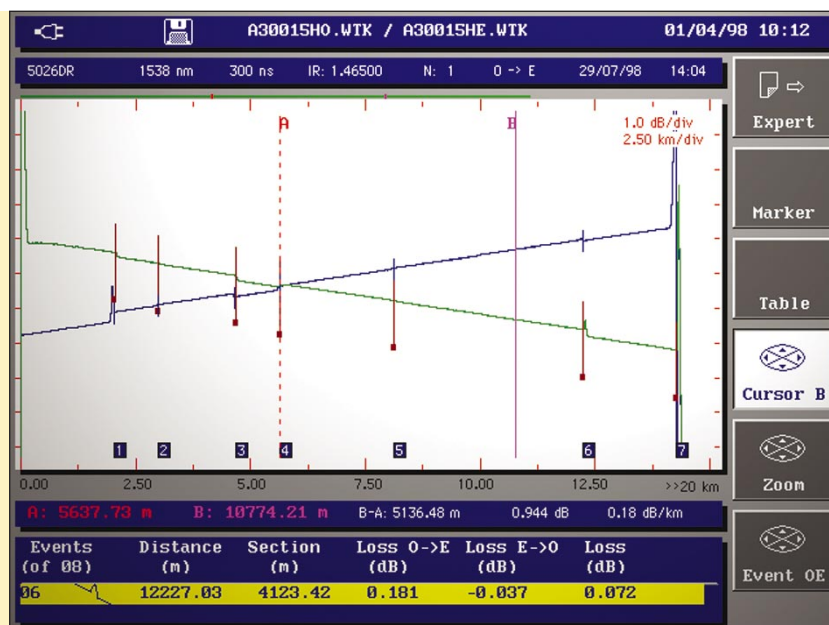
Bidirectional trace and table

The MTS e houses all the essential tools for installation and maintenance of fiber optic links. The complete range of test modules enables fiber characterization using a single unit.