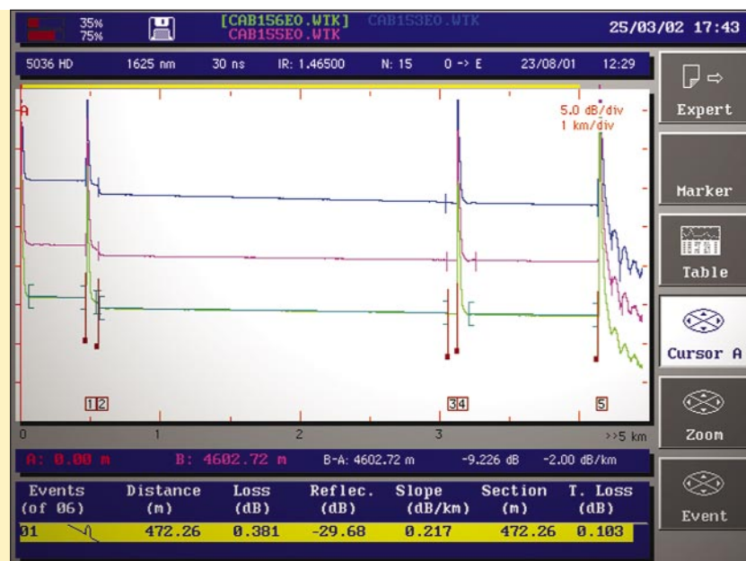
Multiple wavelength display with a single press of a button

The MTS ® OTDR module is the fastest and most accurate OTDR to-date. It offers a dynamic range of up to 44 dB at 1550 nm and boasts a 0.1 second sweep time. As part of the MTS ® , the OTDR module has a test capability of more than 200 km and can measure up to 128,000 separate datapoints with 4 cm sampling resolution. The product's short deadzone enables the user to differentiate events down to 1 meter.